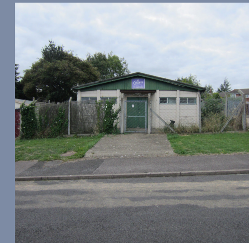
Existing Scout Hut from Hope Green

The proposals exclude any work to the Scout Hut and will not restrict the organisation in modernising or maintaining their property at any point in the future.