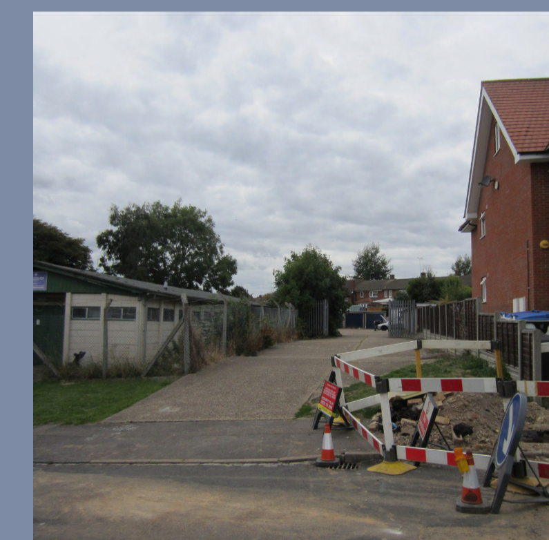
Site entrance off Hope Green