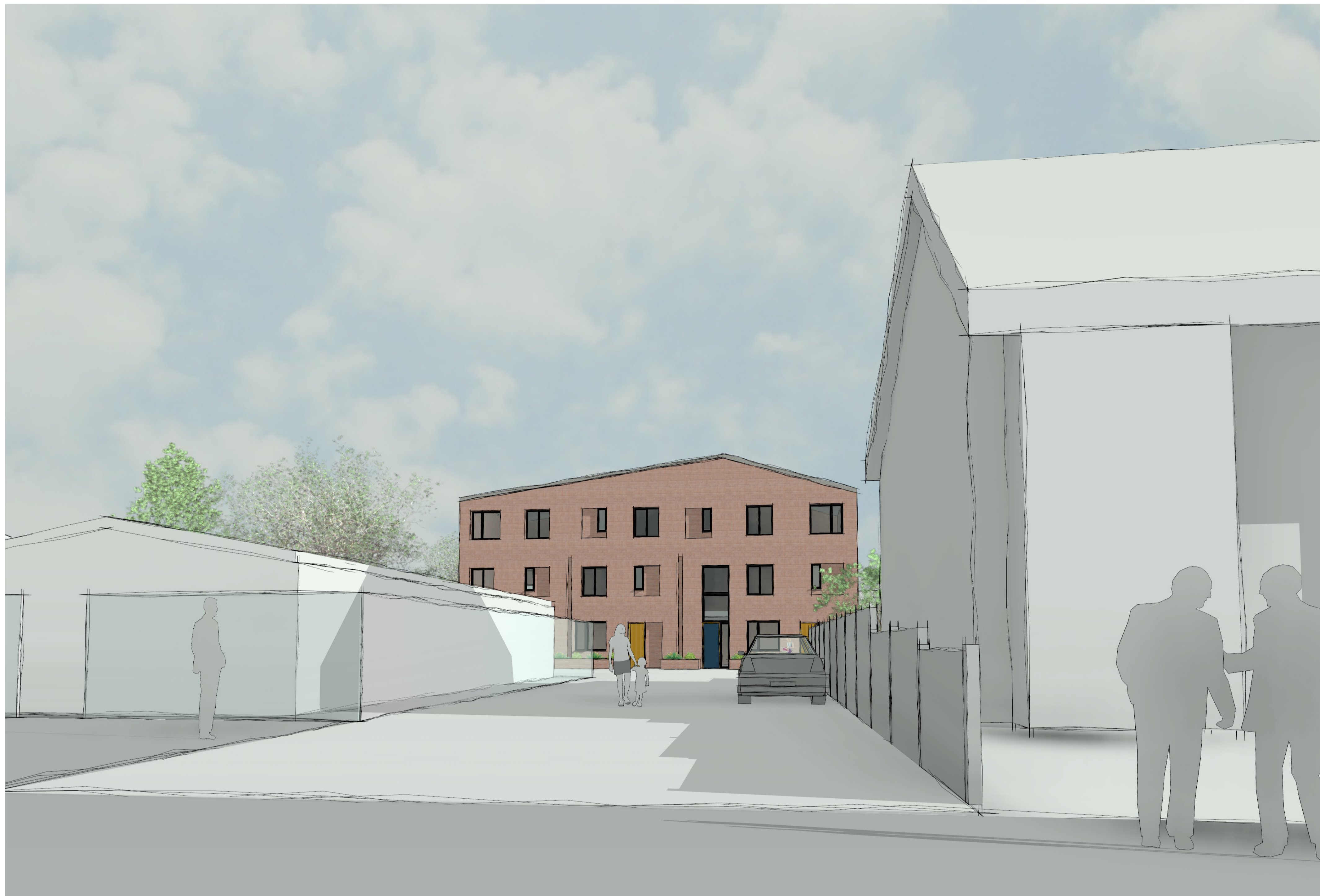
Visual from Hope Green