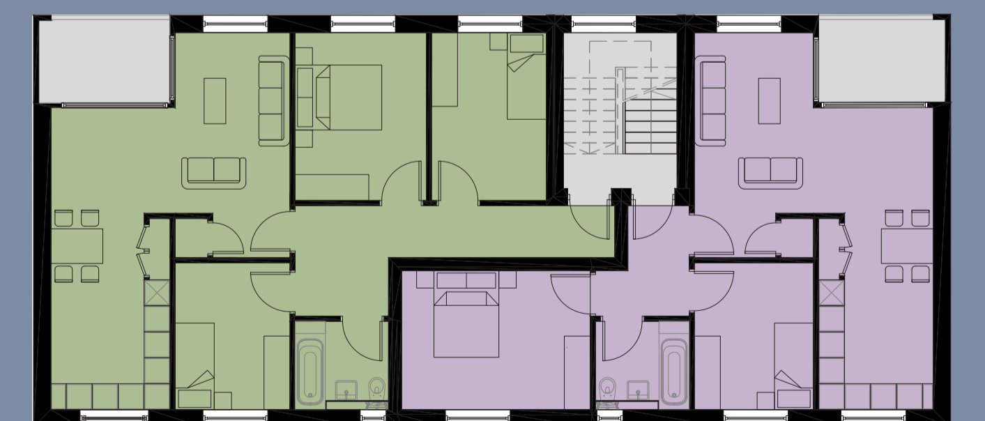
Second Floor Plan - 3b4p and 2b3p flats