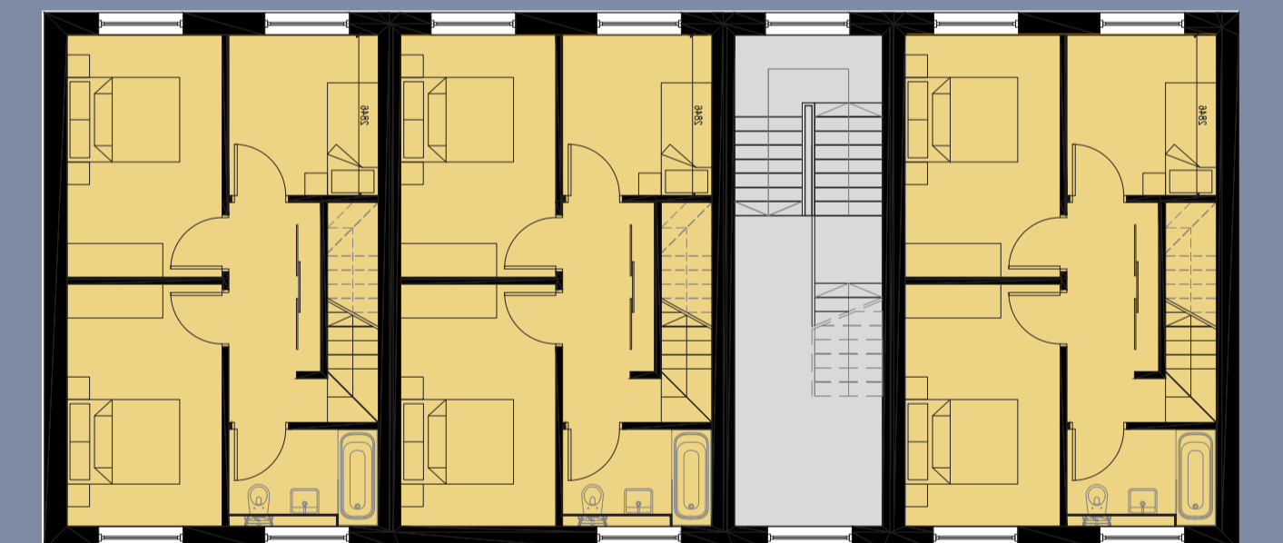
First Floor Plan - 3b5p duplex

Each home is designed to national space standards and will have increased levels of insulation to minimise the energy costs for tenants.