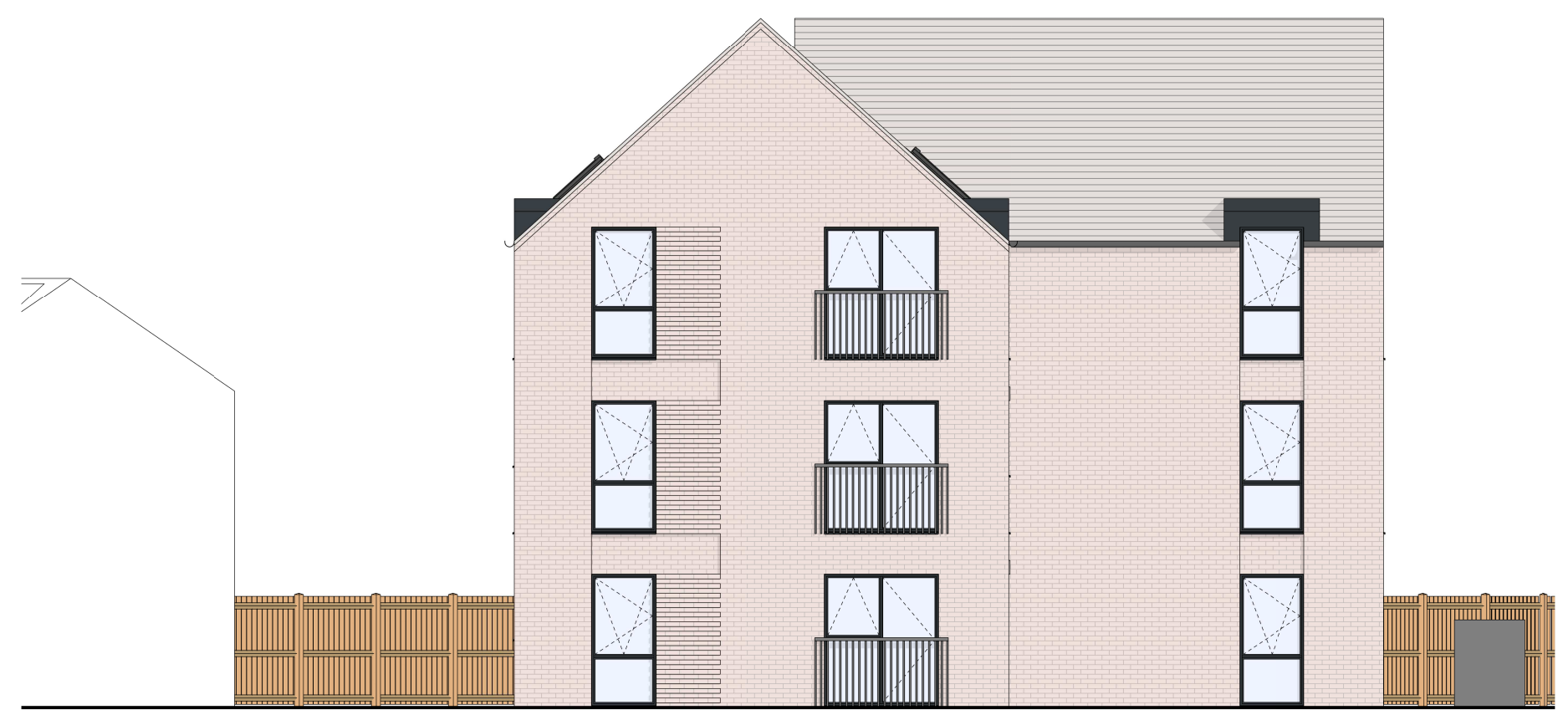
4 North elevation 1 : 100