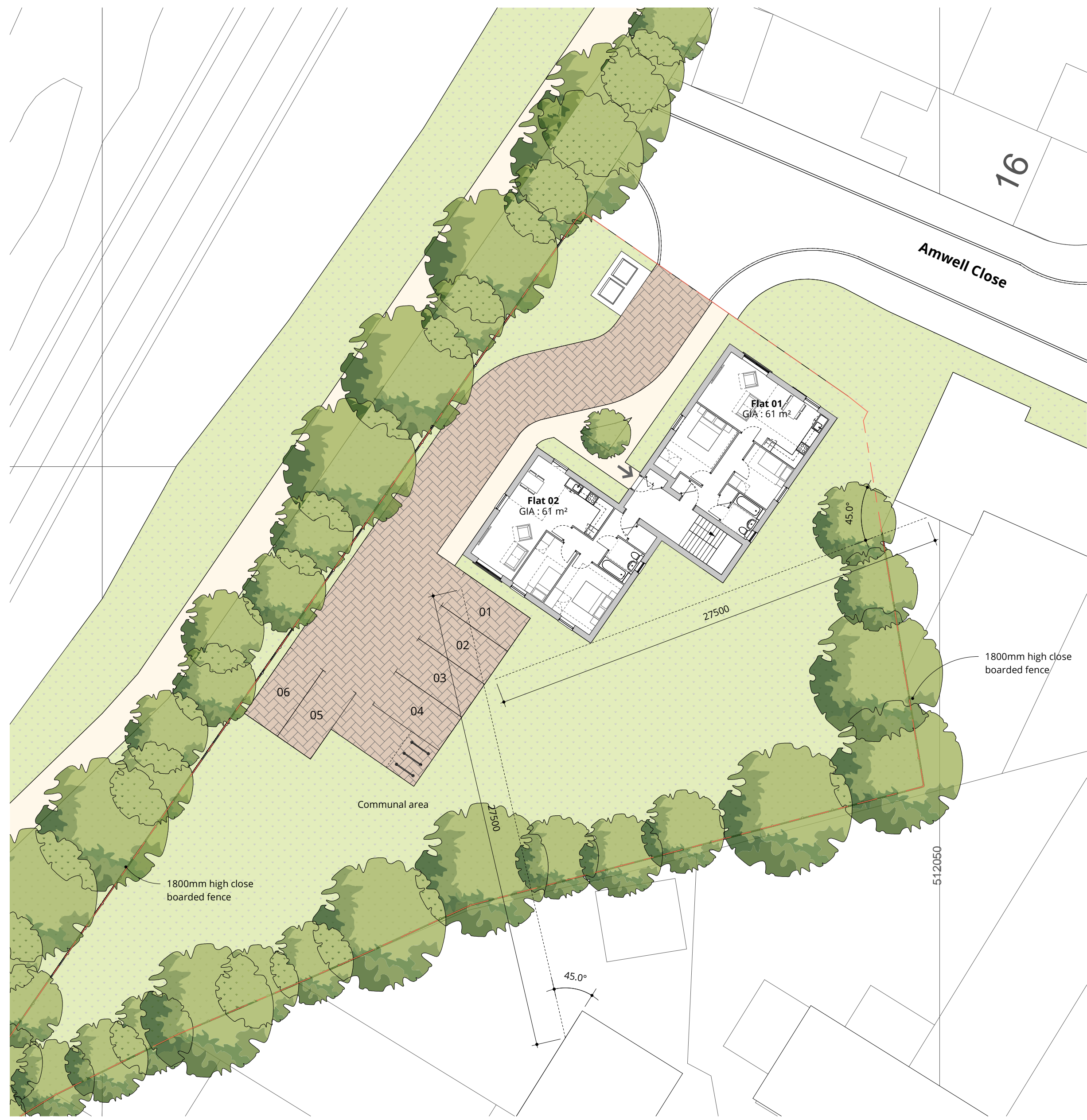
1 Level 0 1 : 200