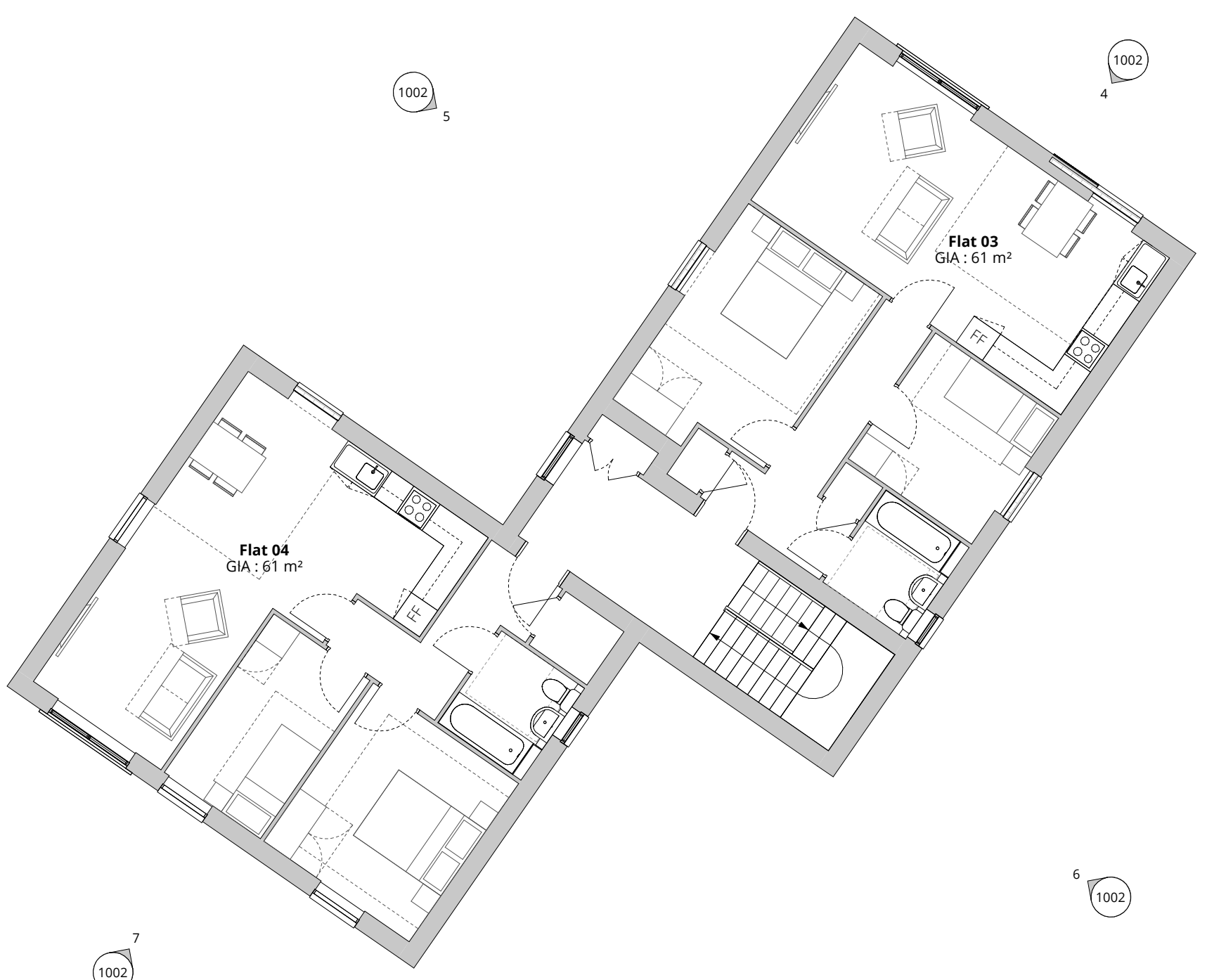
2 Level 1 1 : 100