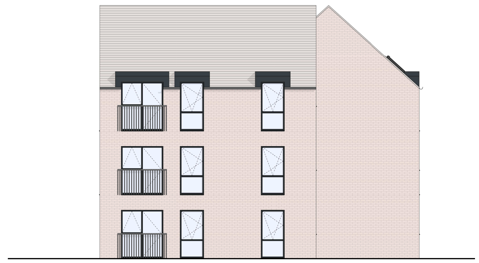
7 South elevation 1 : 100