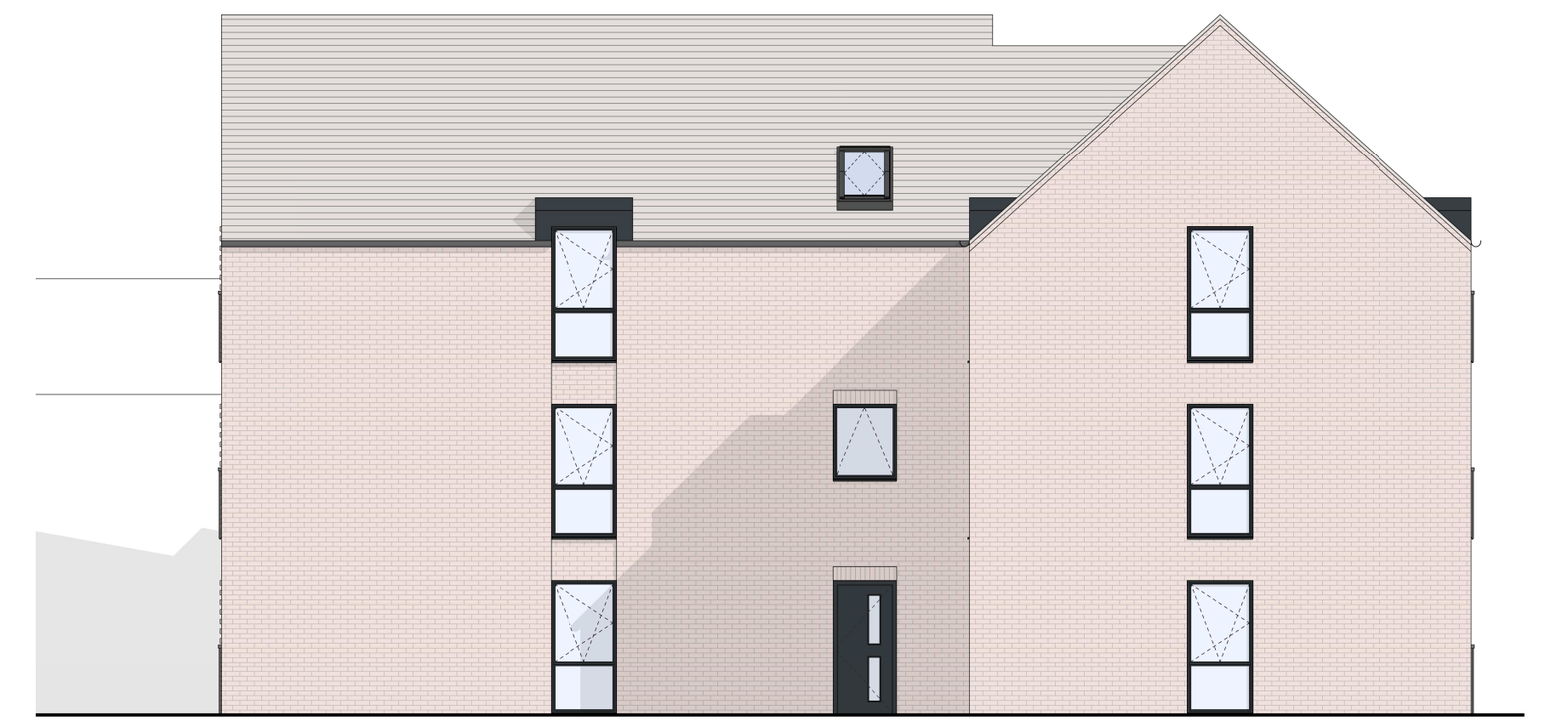
5 West elevation 1 : 100